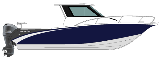
Centre cab hard top