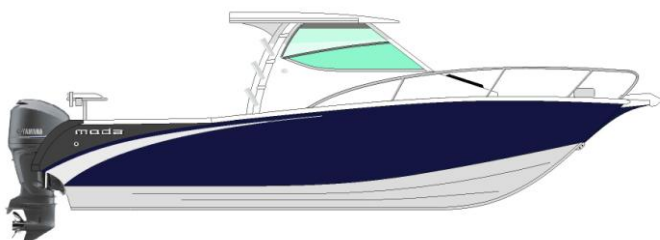
Sports centre cab